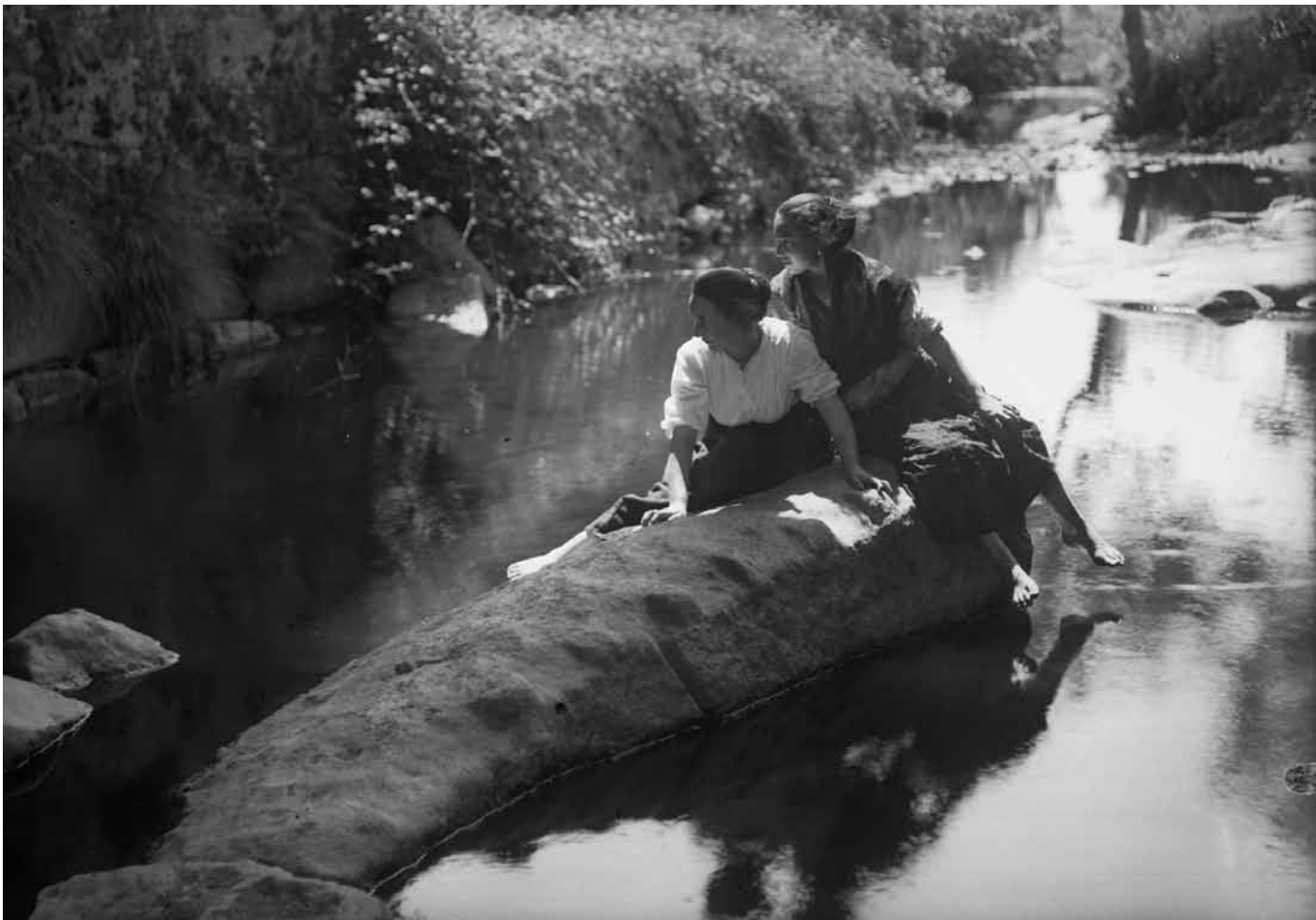
Domingos Alvão (1869 – 1946), Untitled , ca. 1910s, gelatin on glass negative, 13 x 18 cm, Centro Português de Fotografia, Direcção Geral dos Arquivos Torre do Tombo, Porto.

In fact, Joshua Benoliel's work and that of his colleagues also contributed to altering the mechanisms of political propaganda, given the new balance of power that the illustrated press now imposed on the mass media.