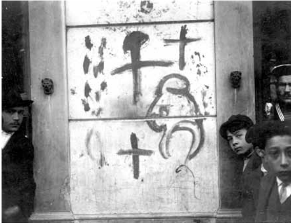
Joshua Benoliel (1873 – 1932), Graffiti on the Street during Elections , 1908, glass plate/silver gelatin negative, 9 x 12 cm, Arquivo Municipal de Lisboa / Arquivo Fotográfico, Lisbon.

Between 1900 and 1938, Portuguese photography was confronted with this confused and divisive historical climate, developing mainly along the following lines: photo-reportage, naturalistic pictorialism, salonnard amateurism and ideological photography, aspects that frequently overlapped with one another and were aligned with the political and cultural dynamics outlined above.