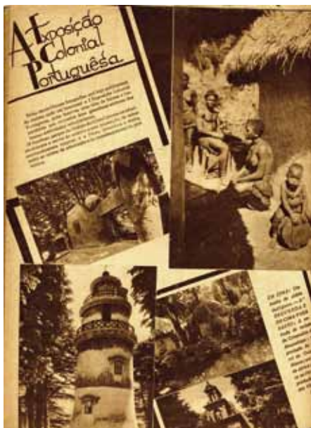
Page with reportage and images by Domingos Alvão about Exposição Colonial Portuguesa (Colonial Portuguese Exhibition), 1934, at Oporto, in O Notícias Ilustrado , 3 June 1934