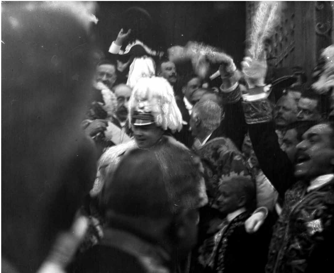
Novais, António (1855 – 1940), Aclamation of King Manuel II in front of the Parliament , 1908, silver gelatin negative on cellulose nitrate, 9 x 12 cm, Arquivo Municipal de Lisboa / Arquivo Fotográfico, Lisbon.

By challenging models that tended towards academicism and establishing an art that was based on modernist foundations and on concepts such as futurism, these movements were to determine the direction of cultural life at the beginning of the 20 th Century. Exhibitions proliferated, with more and more artists outlining a new artistic panorama, in a relationship that cut across several domains, such as literature, painting and illustration.