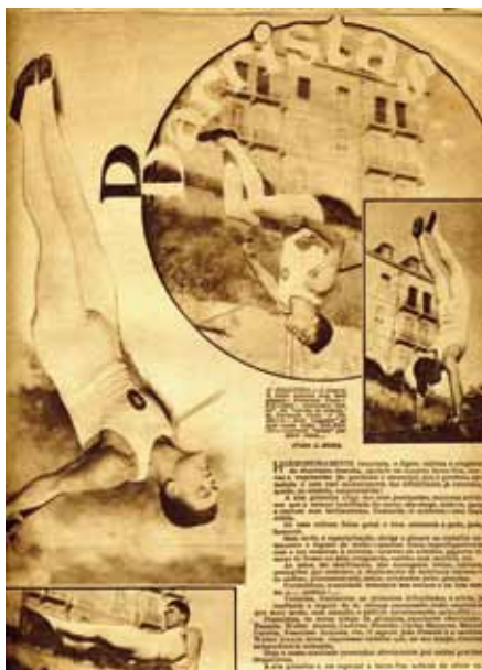
Page of the journal O Notícias Ilustrado with one modern typographical composition about Sport, 3 June 1934

the Calouste Gulbenkian Foundation in Lisbon in 1998. His archive is held at the Calouste Gulbenkian Foundation and at the General Directorate for Archives/Torre do Tombo in Lisbon.